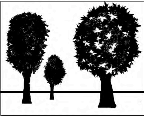
VARIING THE SIZES OF THE TREES GIVES THE ILLUSION OF DEPTH & MAKE AN EVEN MORE VARIED COMPOSITION