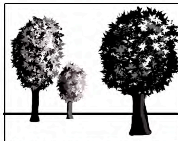
APPLYING 3 DIFFERENT VALUES NOT ONLY CREATES MORE DEPTH BUT GIVES LIGHTING AND DIRECTION